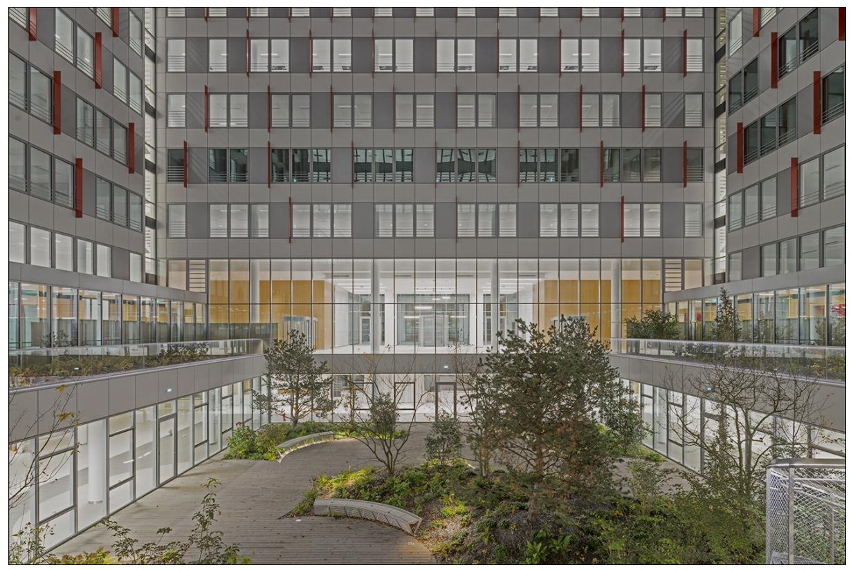
"We have imagined "I'Académie" as a unique and scalable place at the service of working life. Offices are functional and flexible (open space, flex office, business center). Catering facilities "fooding" are proposed in a meeting level open to the courtyard garden which can receive workers and visitors but also hosts events at any time. This flexibility in space and time will meet the professional and social aspirations of men and women who will go through the experience of "I'Académie". The success of this significant project has been possible throughout the work accomplished by Axe Immobilier with Caceis, Crédit Agricole Assurance and Amundi" said Alain Beynet, partner and cofounder of Axe Immobilier.